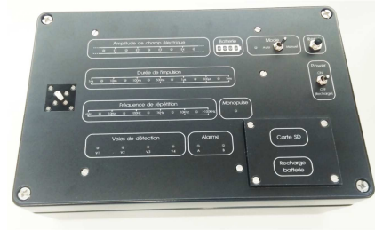
Figure 2. 4 channels IEMI detector.