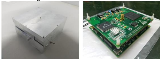
Figure 2. Picture of the detector and its high-speed PCB